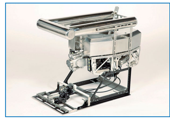
SUSI with X-rail for UT-inspections