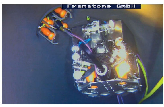
SUSI with satellite camera