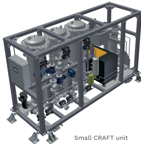
Small CRAFT unit