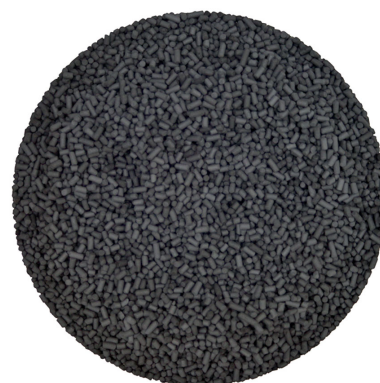
Special activated carbon